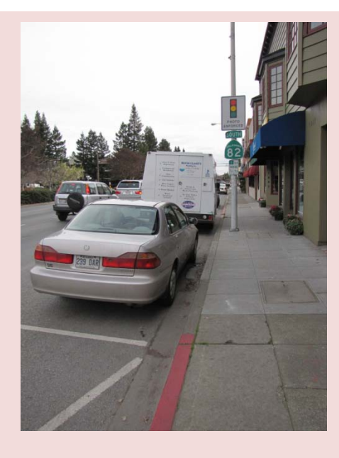
SB on El Camino at Menlo