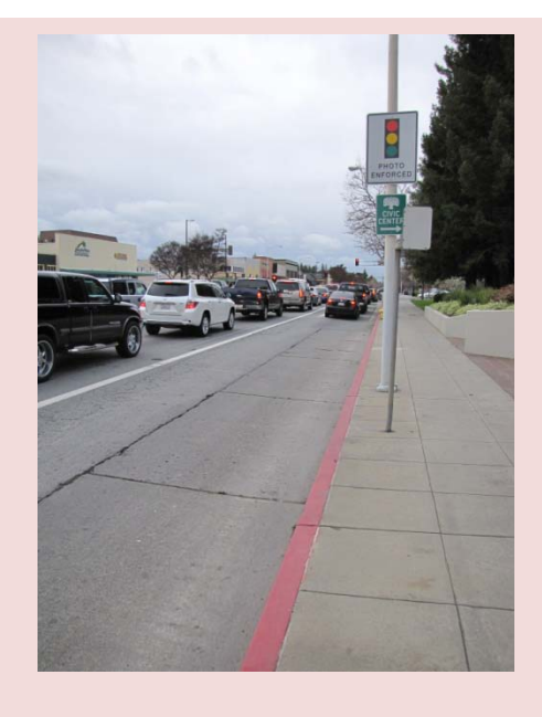
NB on El Camino at Ravenswood