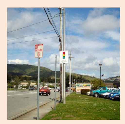
Hickey & El Camino