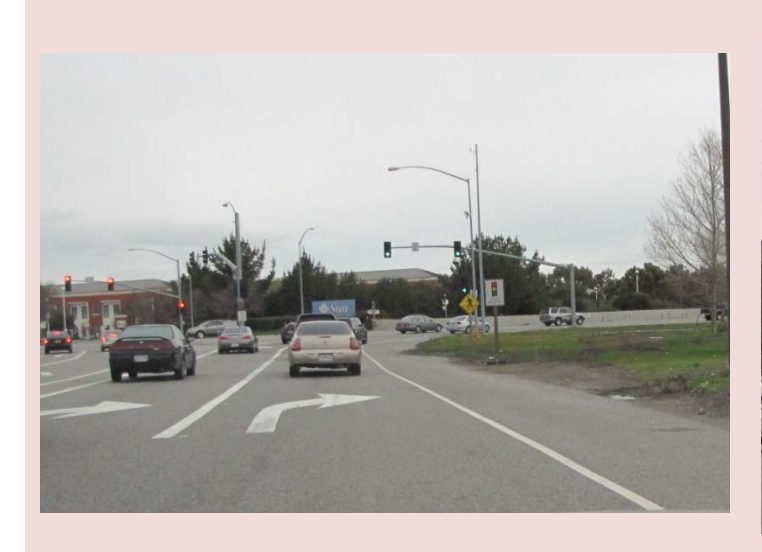
EB on Willow & Bayfront Exp.