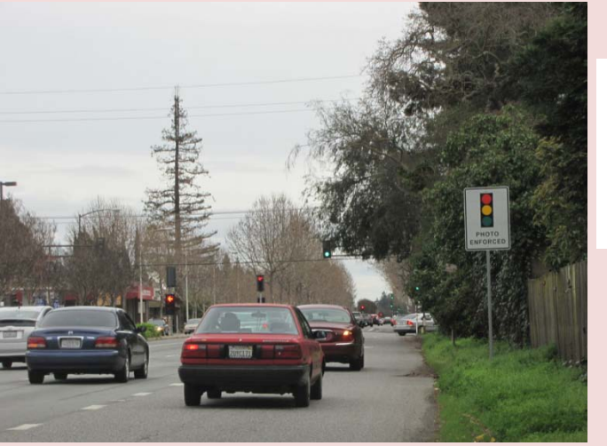
SB on El Camino & Valparaiso There are no cameras in the EB direction

PHOTO ENFORCED Warning Signs Used In Menlo Park tend to be in the far right hand lane and some distance from the intersection.