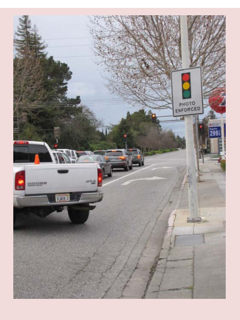
NB on El Camino & Glenwood