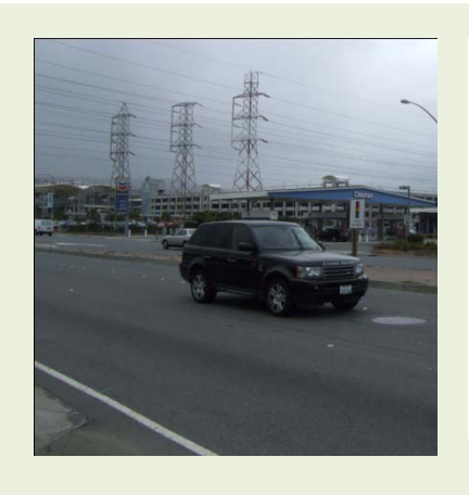
This is the only Warning Sign used at the intersection of Millbrae Ave and Rollins Rd in Millbrae. It is not clearly visible to all drivers.