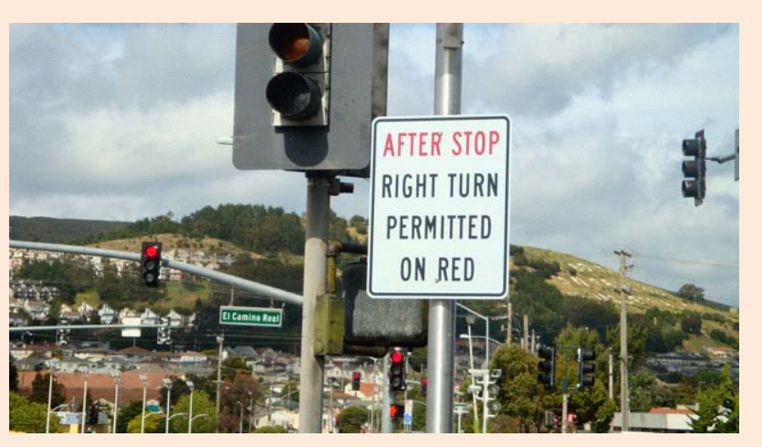
This warning to stop before turning right is located on southbound El Camino Real