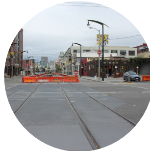
Construction poses another hazard for cyclists moving through the area.