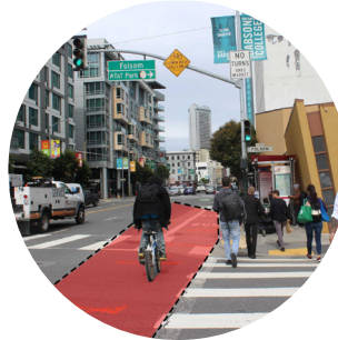
Bike lanes shared with transit and other vehicles offer no protection for cyclists having to move through those areas.

Safety is the number one reason women don't bike, they're afraid of cars.