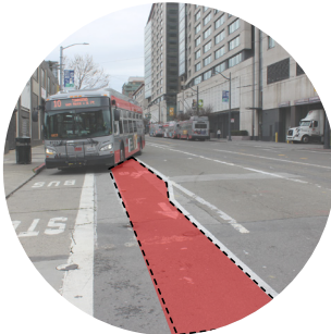
Bus drop offs cause pinch points for cyclists moving through the area.