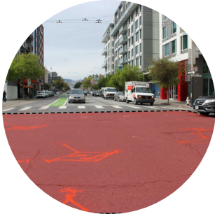
Potholes and poor upkeep of roads are a deterrent to female cyclists.