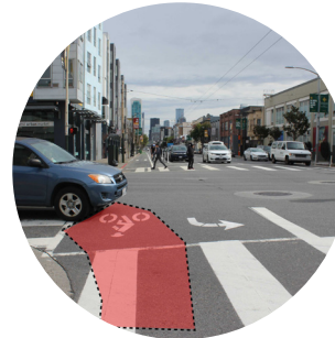
Lack of bicycle infrastructure to support cyclists making right turns onto Howard. Causes cyclists to use pedestrian crosswalk instead of staying in the bike lane.

I want to bike more, even though I get concerned about the traffic. The traffic is crazy here in the city...right now I BART and walk, and I'd like to BART and cycle, so I can get that exercise.