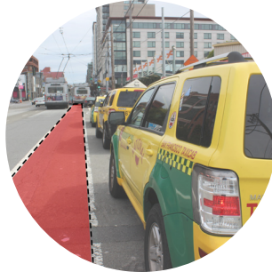
Shared drop off lanes causes tensions between buses, taxis, and cyclists.